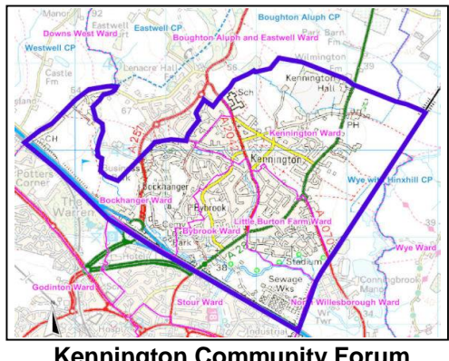
Kennington Community Forum